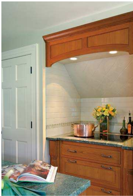
(Above) Utilizing a nook under the staircase, the cooking grotto houses storage for pots and pans, and two pull-out spice units. The induction cooktop is vented via a downdraft unit.