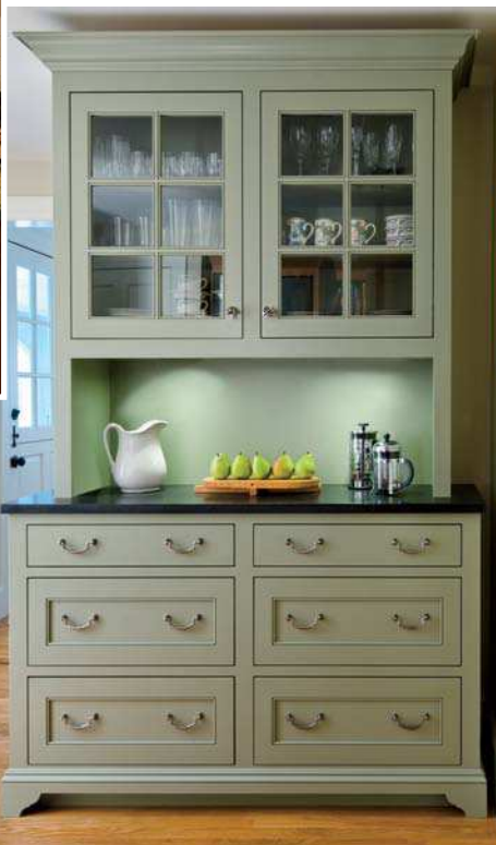
(Right) A custom designed sideboard and hutch top is used to store silver, dinnerware, and function as a beverage station.

By implementing three wood finishes throughout the space with free-standing, furniture-like pieces, the design team was able to maintain the flavor of an English Country kitchen with elegance and refinement, seamlessly complementing the style of the Royal Barry Wills' Cape architecture.